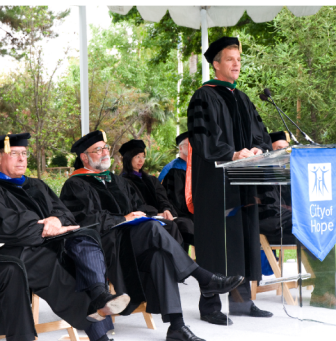
Graduates of the program are awarded the degree of Doctor of Philosophy in biological sciences.