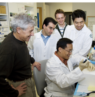
Students learn to be outstanding research scientists in chemical, molecular, and cellular biology.

And so, the idea emerged to make a major grant to the graduate school. This ultimately took the form of a donation of $5 million, which was matched by a $5 million anonymous gift. An additional gift of $2 million created the Irell & Manella Visiting